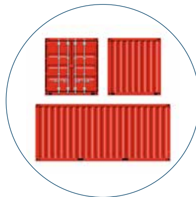
Lockable 20 foot container