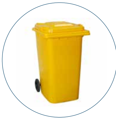
240 Litre WEEE Bin