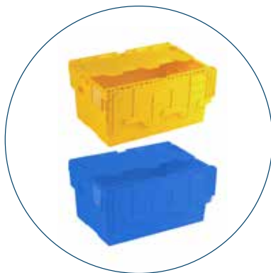
Small WEEE and Battery Boxes