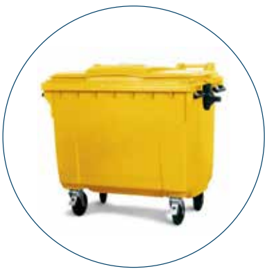
1100 Litre WEEE Bin

Below are pictures of the types of containers we provide: